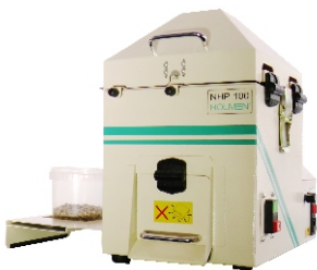
Portable / Manual Feed Pellets