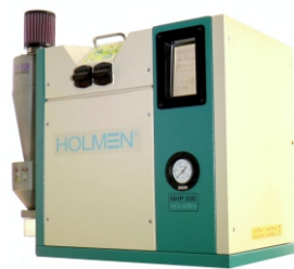
Desktop / Automatic Feed & Wood Pellets