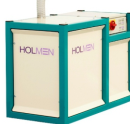
In-line / Automatic Feed & Wood Pellets