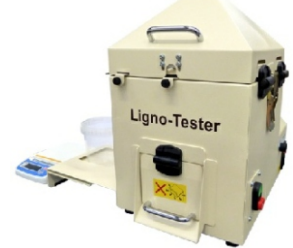
Portable / Manual Wood Pellets